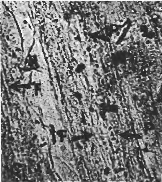
Figure 2. Spodogram of silica deposited in a Juncus leaf (100 X). Note the small, irregular phytoliths (P) and some fibers (hyaline streaks, F).